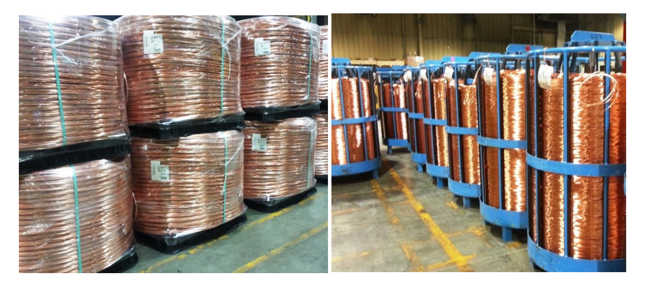
Figure 1. Copper Rod (left) and Copper Wire (right) Made at Essex

Copper is widely used for electrical and electronic applications in industry and in our daily life. Copper usually is the first metal for considerations in such applications because of its unique combinations of performance and availability. Copper has highest electrical conductivity after silver among all other metals whereas it has a relatively low cost with abundant resources.